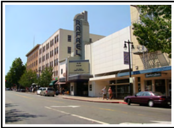
The Rafael Theater