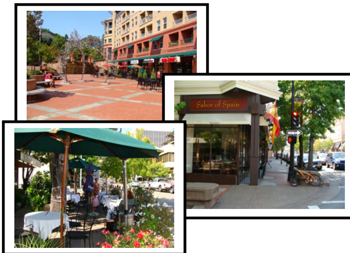
Restaurant and Merchants with Food & Wine Samplings

The 2nd Annual Taste of Downtown San Rafael ~ Wednesday, September 22 nd , 2010 ~ 4:00 pm – 8:00 pm Produced by Steven Restivo Event Services, LLC ~ Ph: 1-800-310-6563 ~ 415-456-6455 ~ Fax: 415-456-6436