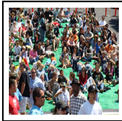
Astroturf for Movie Viewing